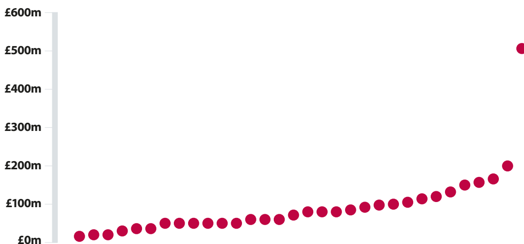
Figure 3 What is the estimated total cost of your trust’s capital needs over the longer term (ie 5-10 years)?

Mental health trusts have expressed concerns that there is such uncertainty about ongoing access to capital, in particular from 2022 onwards.