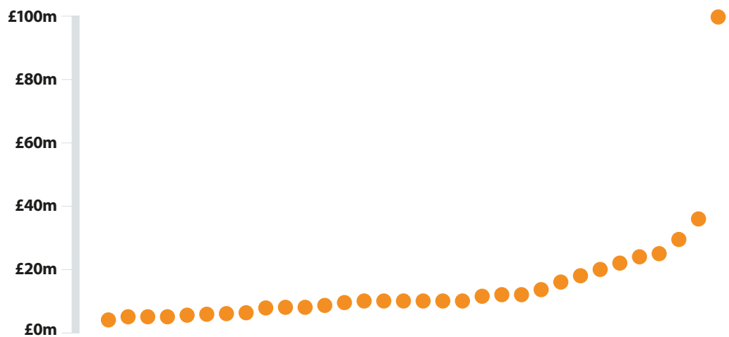
Figure 1 What is the estimated total cost of your trust's capital needs in 2020/21?

A small number of trusts' estimations are significantly higher, with one trust requiring an estimated £100m of capital investment next year, mainly in order to fund significant redesigns of two inpatient services.